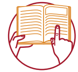
Achieving gender equality in education could increase farm yields by 7–22% (Van Crowder, 1996)