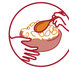
Women produce almost half of the world's food (FAO)