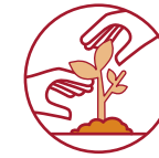
Often, women must grow crops on degraded, smaller plots than those owned by men (Gurrung et al, 2006)