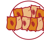
If women had the same access to resources as men, farm yields could increase 20–30% (FAO, 2011)